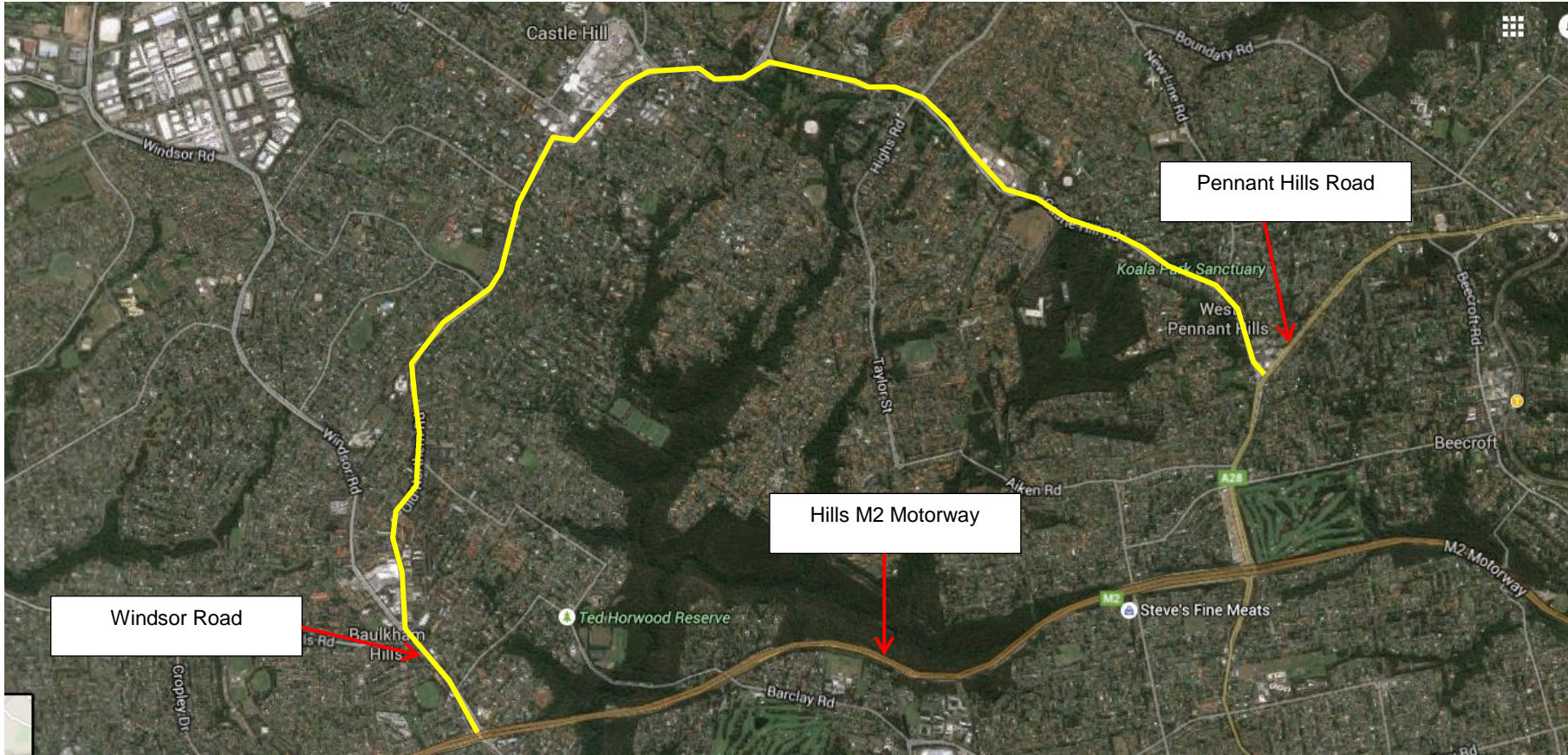
Detour via Windsor Road, Old Northern Road, Terminus Street, Old Northern Road, Castle Hill Road and Pennant Hills Road.