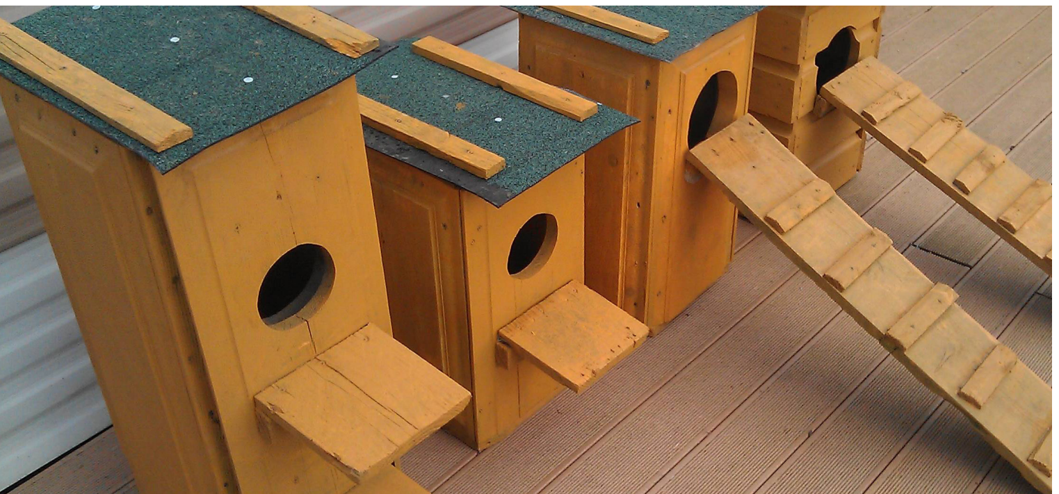
Image shows examples of custom-built nest boxes..

The project team will continue to work with government agencies, councils and the community to reduce impact on the local environment.