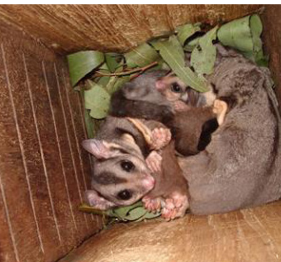
Image shows an example of a nest box.

In order to remove vegetation that is classified as Endangered Ecological Community (EEC), the project is required to offset the impacts by developing and implementing a biodiversity offset package. This package ensures that, for example, if an area of native vegetation is cleared for development, another similar area of native vegetation is protected from future development, balancing the loss of biodiversity due to clearing.