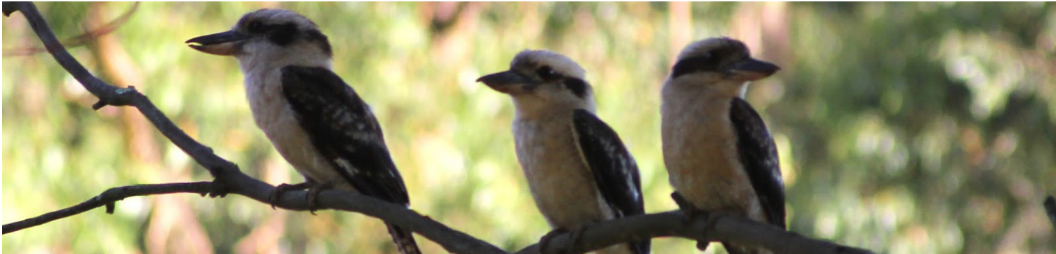
Image shows native Australian Kookaburras.

NorthConnex will deliver significant benefits to local communities by easing congestion on Pennant Hills Road, putting more than 5,000 trucks a day underground and returning local streets to local communities. It will also boost the state and national economies by providing more reliable journeys and shorter travel times for the movement of freight.